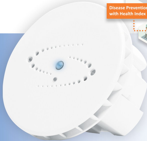
HALO Smart Sensor is Patented.