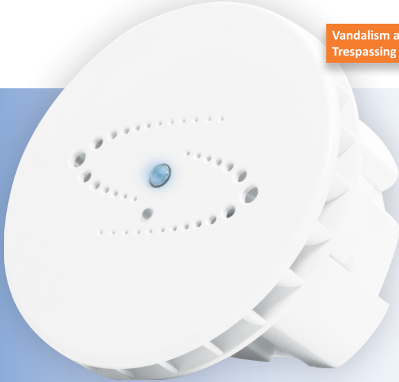
HALO Smart Sensor is Patented.